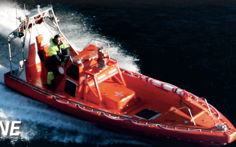
Photo: Norsafe Magnum 750 / rescue boat

BUKH SOLAS MARINE DIESEL ENGINE 330 HP (243 KW)