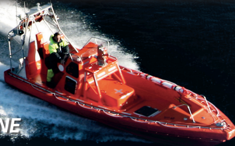
Photo: Norsafe Magnum 750 / rescue boat

BUKH SOLAS MARINE DIESEL ENGINE 435 HP (320 KW)